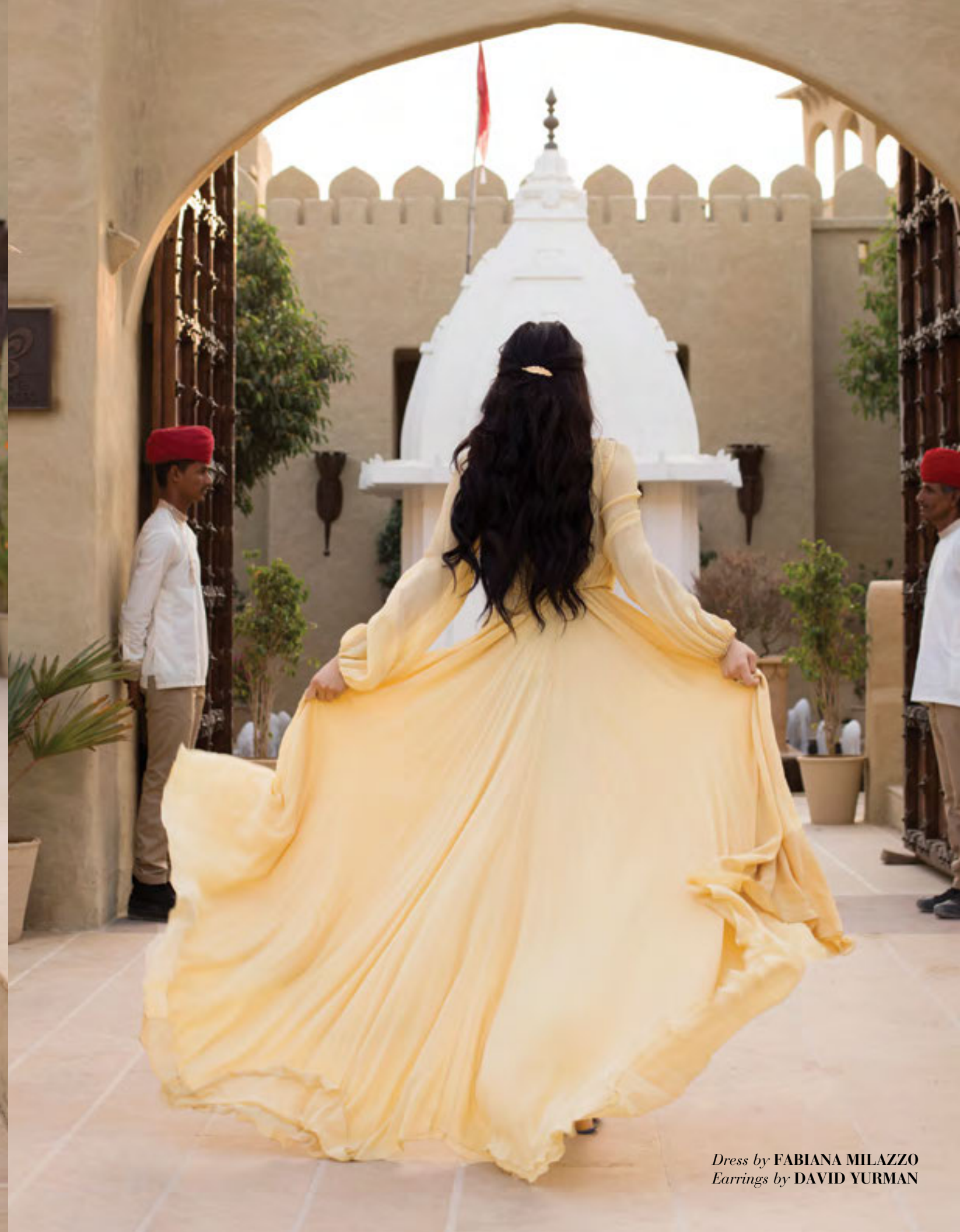
Dress by FABIANA MILAZZO Earrings by DAVID YURMAN