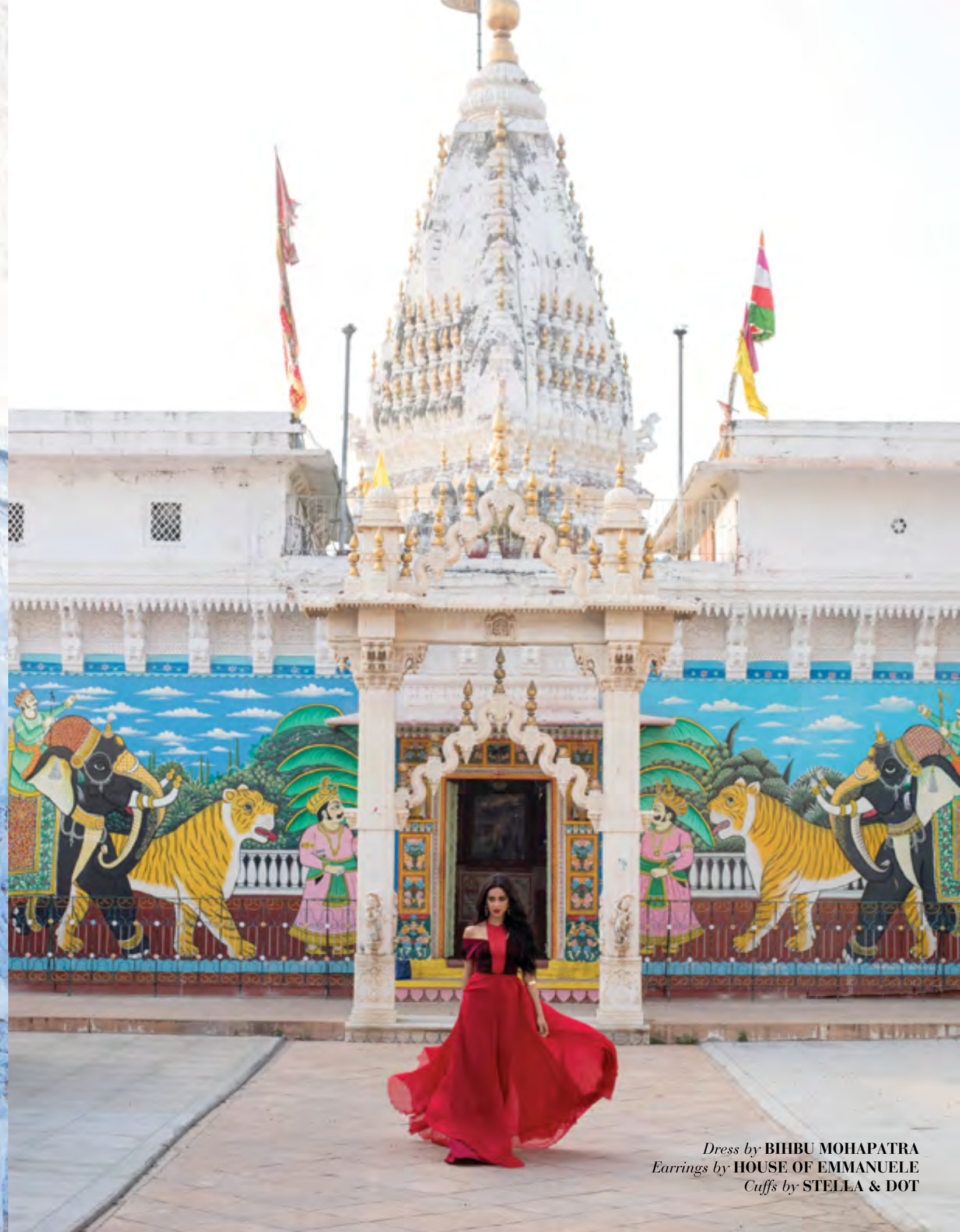
Dress by BIHBU MOHAPATRA Earrings by HOUSE OF EMMANUELE Cuffs by STELLA & DOT