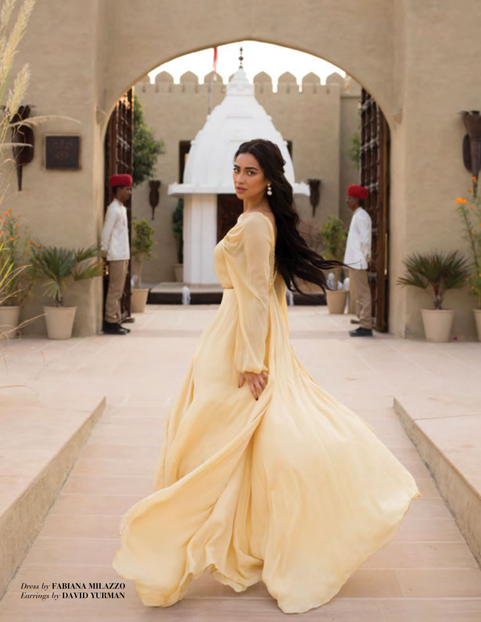
Dress by FABIANA MILAZZO Earrings by DAVID YURMAN