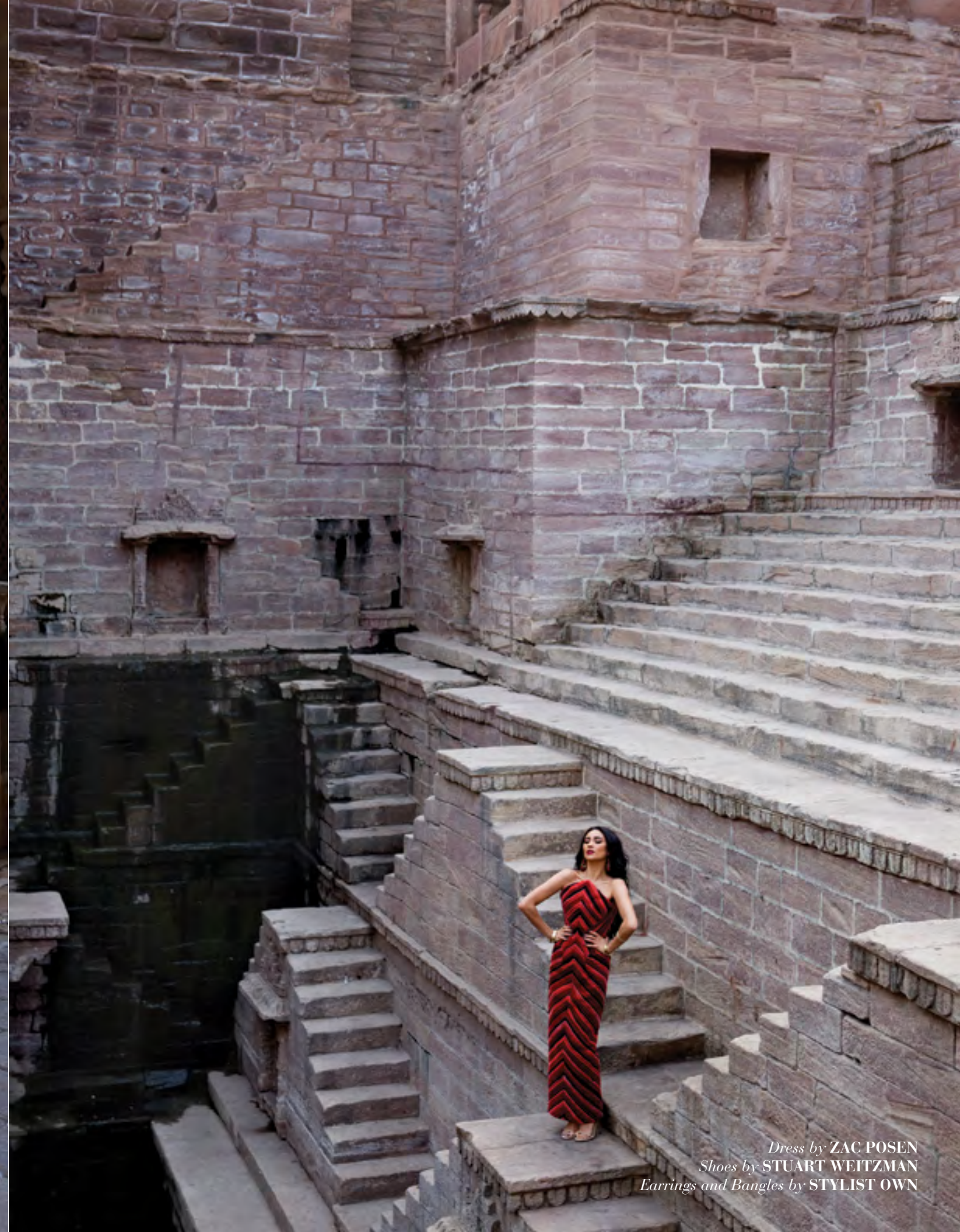
Dress by ZAC POSEN Shoes by STUART WEITZMAN Earrings and Bangles by STYLIST OWN