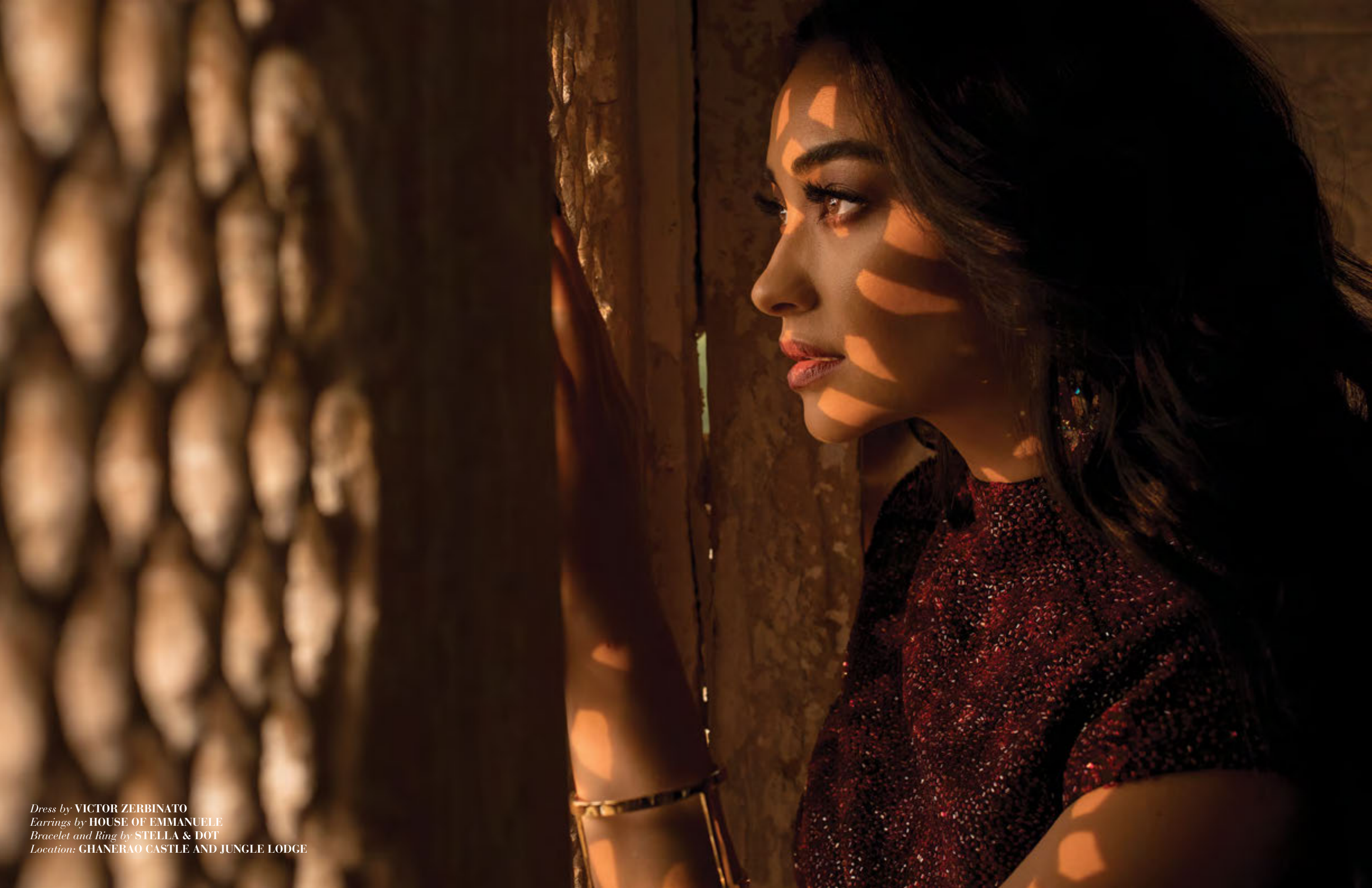
Dress by VICTOR ZERBINATO Earrings by HOUSE OF EMMANUELE Bracelet and Ring by STELLA & DOT Location: GHANERAO CASTLE AND JUNGLE LODGE