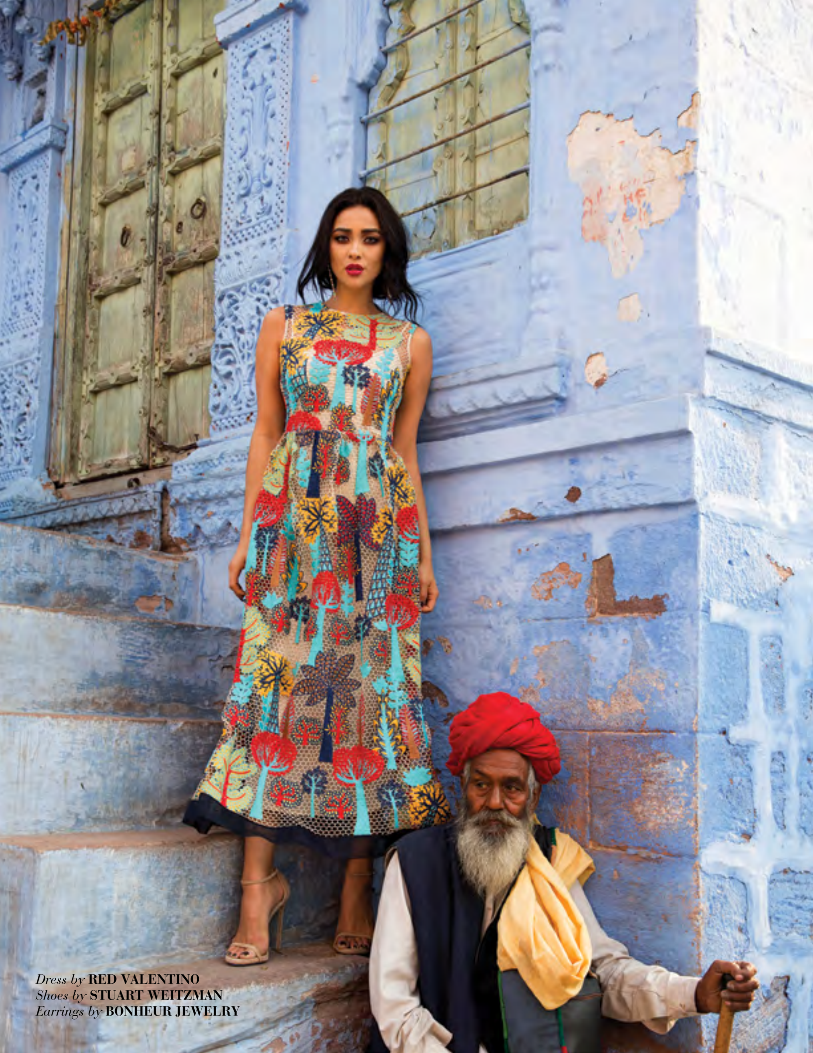
Dress by RED VALENTINO Shoes by STUART WEITZMAN Earrings by BONHEUR JEWELRY